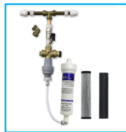
Installation rail with green Filter Housing and green Carbon Block Filter Candle or green nanofilter Candle.