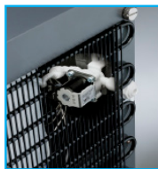
FloodGuard - Inlet solenoid only opens to allow water into the cooler, when water is dispensed. By remaining closed all other times it protects the cooler against leaks.