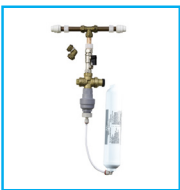
Installation Rail with FILTER XL In-Line Filter.