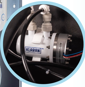
The KLARAN WS UVC LED Shield is positioned in front of the Cooler Tap to provide point of dispense disinfection.