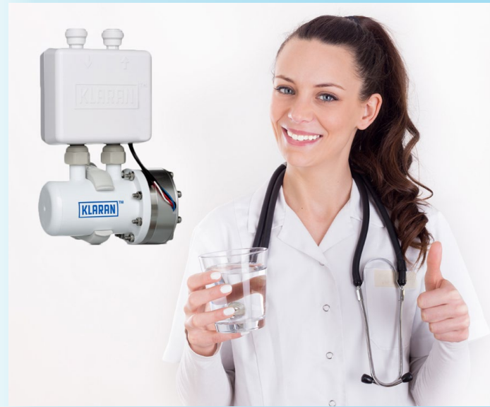
The KLARAN WS UVC LED Shield destroys 99%+ of Cryptosporidium, Giardia, E-Coli, Pseudomonas and Legionella, as the water passes through the Reactor from the tank to the tap.

The KLARAN WS UVC LED Shield represents a major technological break-through by providing 24/7 protection against bacterial contamination. Simple to Install and Maintenance Free, the KLARAN WS UVC LED Shield adds real value to your Water Cooler offer