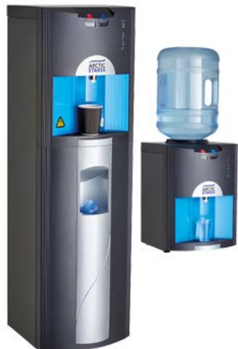
ArcticStar 55 with high performance Hot Water Boiler to 95/96C

PS Some companies prefer to swap the Cooler out to descale back at their workshop, which is often quicker and avoids potential H&S issues at the customers.