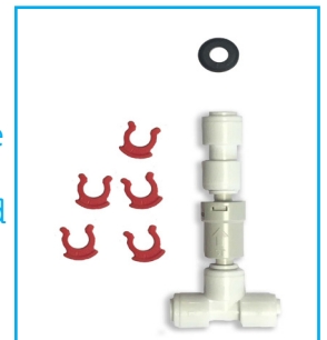
AA First SVKIT