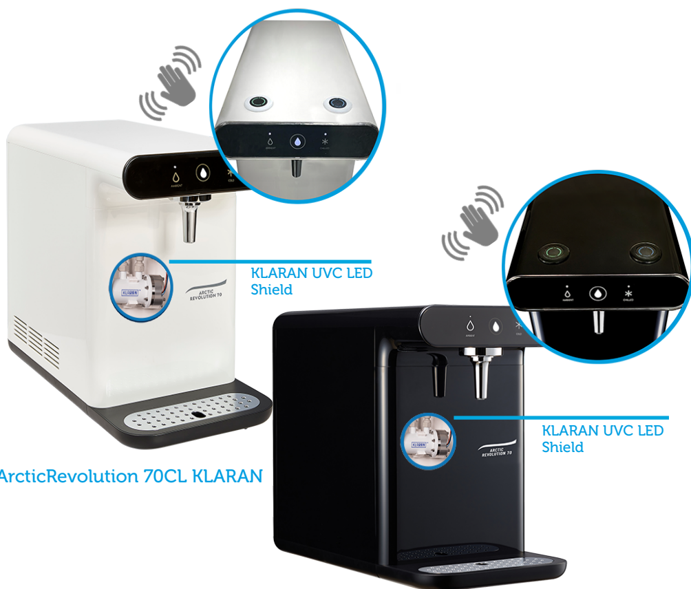
ArcticRevolution 70CL KLARAN

The KLARAN UVC LED shield is situated between the direct chill tank and the dispensing tap to provide point of dispense protection from bacteria and viruses