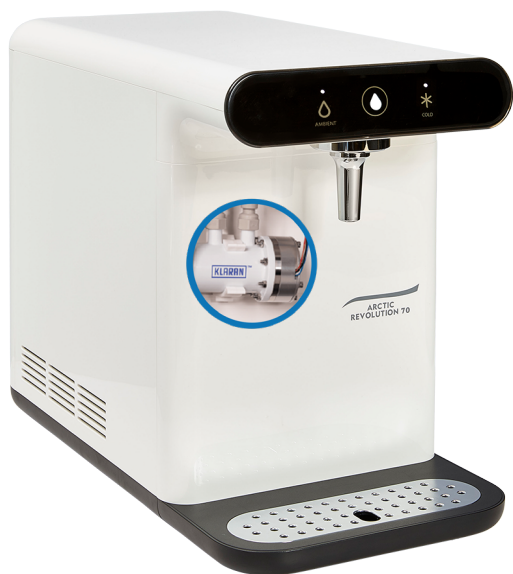
ArcticRevolution 70 KLARAN

The KLARAN UVC LED shield is situated between the direct chill tank and the dispensing tap to provide point of dispense protection from bacteria and viruses